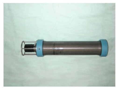
TX Modem (for vehicles)

COM-40K System is designed for transmitting image data from underwater vehicle to support ship in high speed.